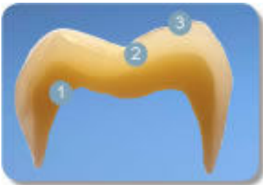
Shows the 3 layers of fused material, and properly designed core.