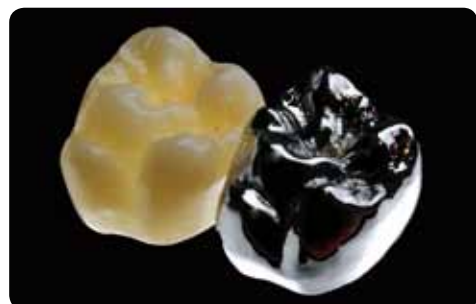
IPS e.max Press crown compared to a full cast crown W. Weisser, Germany